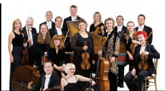
Tafelmusik Baroque Orchestra & Tafelmusik Chamber Choir

Exchange programme with the Jeune Orchestre Atlantique (France) – visit tafelmusik.org/tbsi for more information.