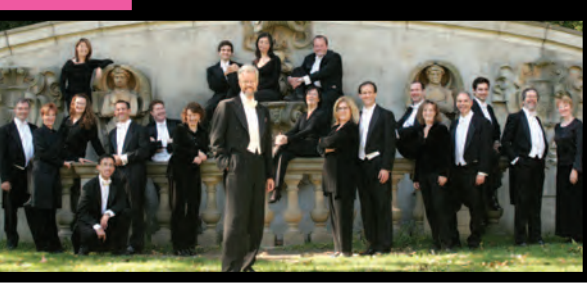
ORCHESTRA & CHOIR