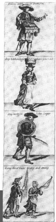
Figure 3 Street vendors of knives, kitchen goods, barrels and laces. Handel used London street cries in one of his works.

After 13 years of living as a long-term guest in various mansions around the city, Handel moved to his own house on Brooke Street, which was within walking distance of Hyde Park. He spent his time in a variety of London buildings, depending on what kind of music he was composing.