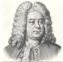
Figure 2 George Frideric Handel

G eorge Frideric Handel was born in Germany in the same year as J.S. Bach, 1685. Although the two famous composers never met, they both suffered from failing eyesight in old age and both went blind after botched eye operations by a shady English eye doctor named John Taylor.