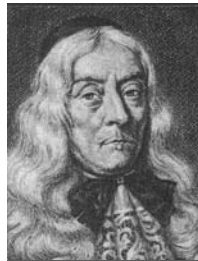
Figure 1 A portrait of Handel's father, a famous barber-surgeon, taken long after his own visit to a barber.

Unlike Bach, who came from a long line of professional musicians, Handel was the son of a barber-surgeon (a common combination at the time) who was determined that his musical son should become a lawyer. He forbade Handel from playing any instruments but the boy smuggled a quiet keyboard into the attic and secretly learned to play. On a visit to the duke who employed his father, Handel gave a dazzling performance on the organ and was then allowed to take lessons in violin, harpsichord and composition, as long as he also promised to study law.